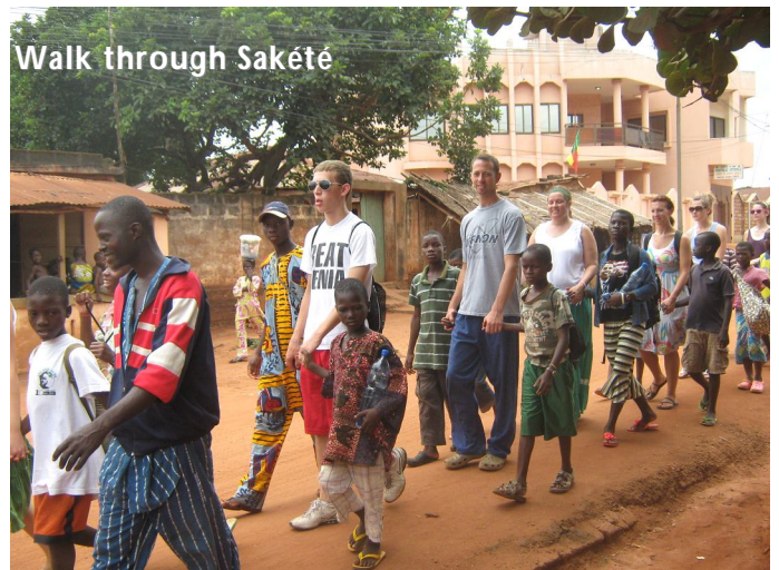
Walk through Sakété