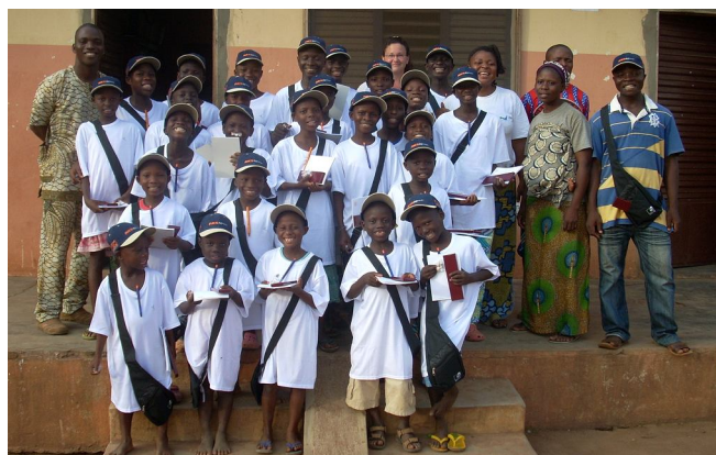
The Yedidja children and co-workers with their gifts from « Le Pas - France »